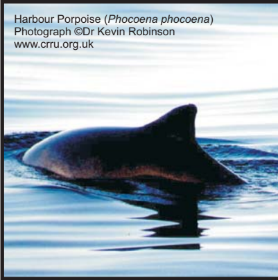
Harbour Porpoise ( Phocoena phocoena)